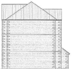
SIDE ELEVATION AS PROPOSED